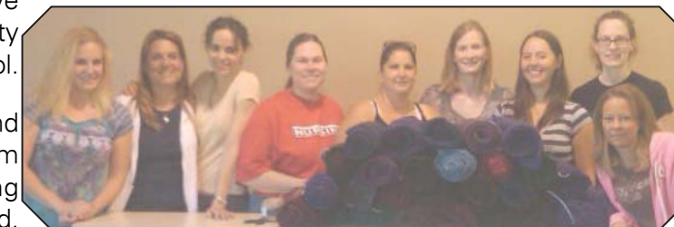
Working on the Orphan Grain Train Project

Free Moms meets the second and fourth Thursday of each month from 9:00-11:00 a.m. in the Gathering Place at church. Nursery is provided. Join us as we share laughter and tears and talk about being wives, moms, and women who long to become more like Jesus!