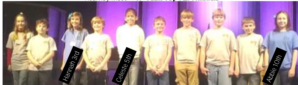
Kearney Meet— "C" Team Top Ten Finishers