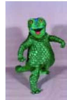
Geddy the Gecko - part sports mascot, part fun song leader, will inspire young and old to tell the entire world about Jesus

The next Rock Solid Family Night will be presenting Geddy the Gecko at 6:45 p.m. Wednesday, January 26 in the Worship Center. Larger than life, Geddy, will take the audience around the world with fun music and songs from various countries accompanied by lots of laughs. Children and adults of all ages will certainly enjoy Geddy's pro sports mascot personality. Following the global adventure presentation, kids will be taught "How to Share Their Faith" using motions.