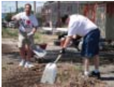
Huge amounts of clean-up work is still needed in neighborhoods devastated by Katrina