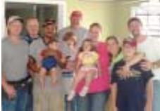
Team members worked on the home of this family. Ours was the 17th team to work on their home. Tens of thousands of homes still need major repair. Our church hopes to send more teams to serve in the future.