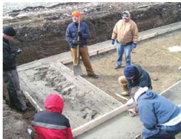
Our church team poured the foundation on Habitat for Humanity Home #54. Volunteers are still needed to serve on Saturday, April 10.