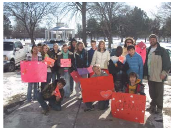
Free Life Middle School students on their Winter Service Day sorted food at Hope Harbor and then said thanks to veterans at the Veterans Home.